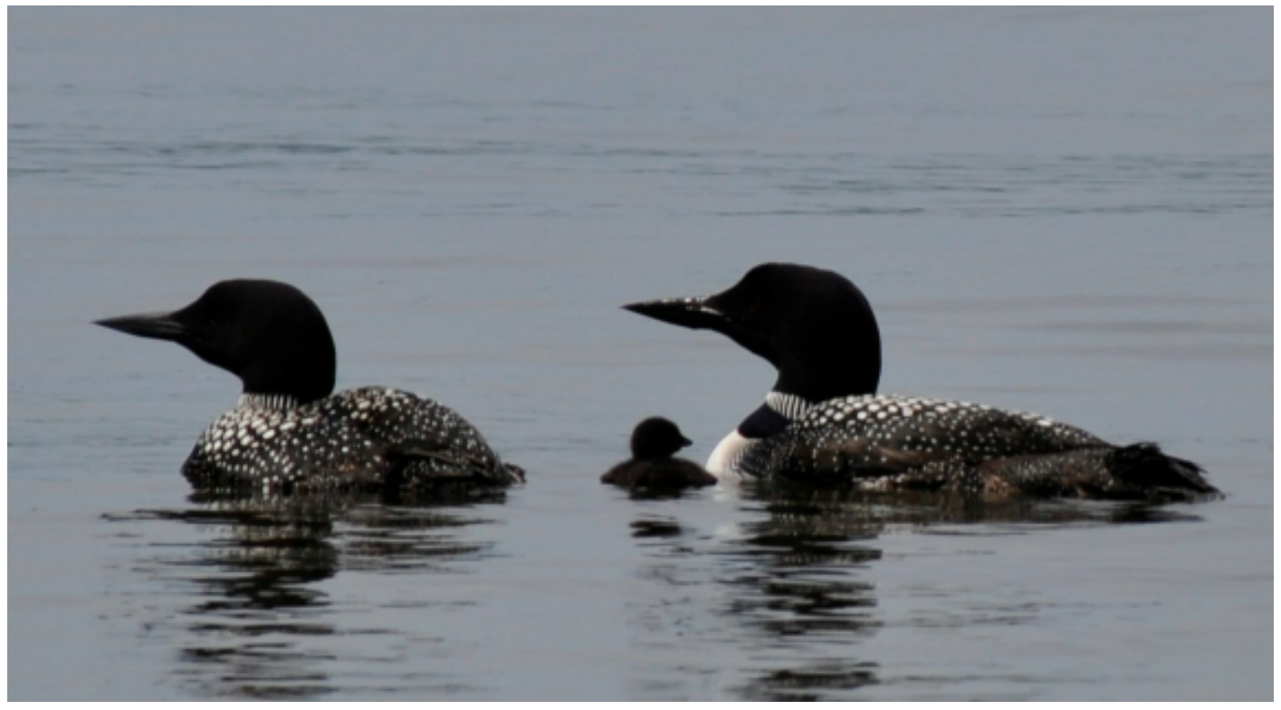
6.17.20 Loon update...